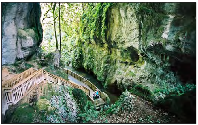
THE NATURAL BRIDGE - WAITOMO

The District is characterised by extensive areas of hill country, some of it steep, particularly the Herangi Range to the west.