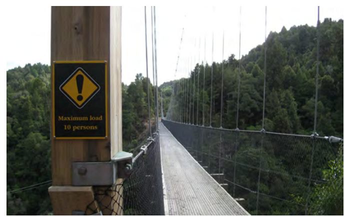
SWING BRIDGE - TIMBER TRAIL

Tawarau Forest located in proximity to Waitomo Village contains significant karst and cave features within the forest. It contains numerous "clean" caves as a result of the intact indigenous forest cover and includes what is probably the largest continuous tract of virgin forest remaining on karst topography in the North Island. The forest is in both private and public ownership and contains excellent examples of the dense rimu/miro forest type which once occurred throughout the region.